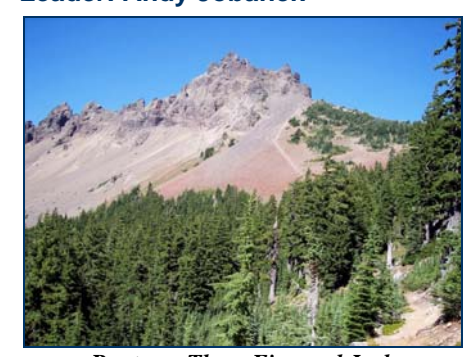
Route up Three Fingered Jack

FOUR OF US SET OUT at 6 a.m. from PCT to try and summit Three Fingered Jack. A good pace got us to the crawl by 10. Along the ridge we ran into two climbers who had thought the crawl was 500 yards before it actually was. Due to their mistake we were able to pass on the clear trail to the left while they clung to a rock wall with over 2,000 feet of exposure.