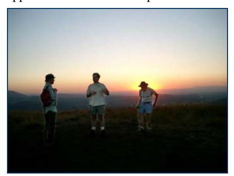
Sunset on Pisgah

On a BEAUTIFUL summer evening in the glow of a sunset we hiked up Mt. Pisgah. On top, we were rewarded by a cool breeze, a full moon emerging from behind Diamond Peak and a congenial group to appreciate and share the experience.