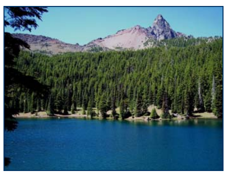
George Lake, Mt. Washington in background

Interestingly, while we were thrashing around in the woods to the northeast of the lake, we encountered a faint trail leading northeast from the lake, complete with sawed logs. This trail doesn't show on modern maps, but may be one of the rumored horse packer trails that lead to the lake basin. Everybody but the leader went for a swim and gave the lake high marks for swimability. Erik pulled an old soda pop can from the bottom, only to find it had been home to a gray salamander. With Rob's binoculars we spotted two rock climbers roped and climbing high on Mt. Washington's fractured southeast buttress. The summit of the mountain is less than a mile from the lake and the view of the southeast face is