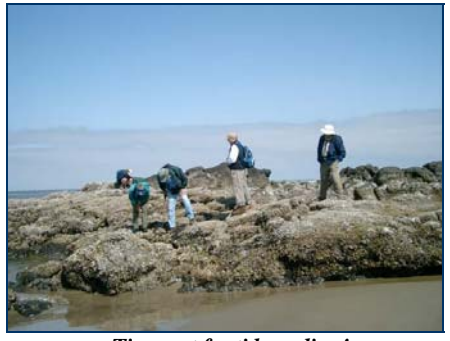
Time out for tidepooling!

Up the Hobbit Trail we went, however. There's a fork in the trail where one has to decide whether to take the easy path or the more interesting and difficult one. For the