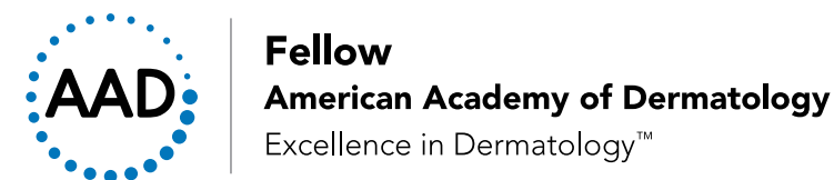
Full Color designation with vision