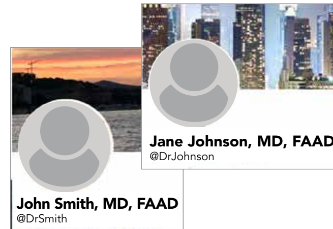
Social Bio with FAAD title