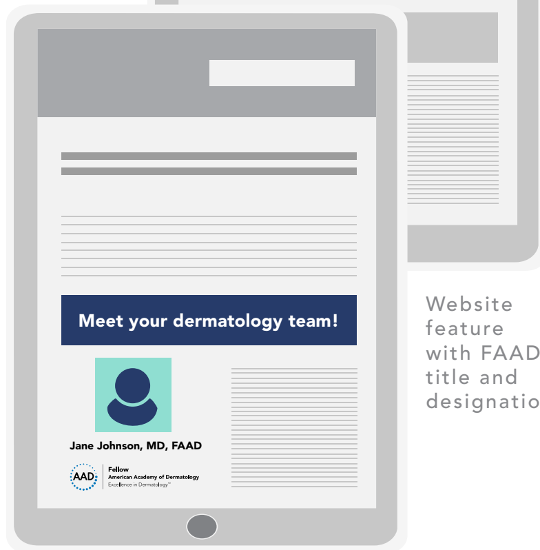
Website feature with FAAD title and designation