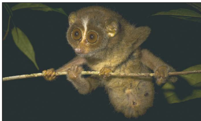
Figure 3. Loris tardigradus tardigradus , for comparison. Kanneliya, Sri Lanka.

Currently, habitat fragmentation and degradation outweigh all other threats to this subspecies. Being an apparent montane specialist, climate change effects on high altitude forest ecology can only exacerbate this threat. Forest fragmentation may be of special concern to the movement and dispersal of L. t. nycticeboides as denseness of its montane forest habitat to which it is adapted may make this subspecies less inclined than other lorises to traverse simplified vegetation such as heavily disturbed or early succession forest (Williams et al. 2002). The regeneration of forest in the montane zone is also inhibited by a number of climatic factors, and montane forests in Sri Lanka are more susceptible to long-term damage due to fragmentation than sub-montane and lowland