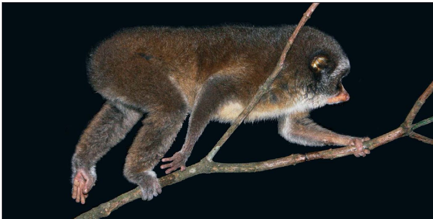
Figure 2. Loris tardigradus nycticeboides , lateral view, Newara Eliya, Sri Lanka.

area in the hope of determining the full extent of the subspecies' range. Continued fragmentation due to agricultural development, die-back of forest believed to be due to climate change (Werner 1984) and, more insidiously, the degradation of montane forest due to firewood collection and cardamom production, may put the area of available suitable habitat at a significantly lower figure. The anthropogenic pressures on the environment in Sri Lanka, which is among the top three biodiversity hotspots threatened by population pressure (Richard et al. 2000), suggest that any organism requiring extensive, non-degraded natural habitat is likely to be threatened with extinction. Regarding the threats to L. t. nycticeboides , Molur et al. (2003) wrote "Local and commercial trade for eyes and meat by tea plantation workers. Possible village level trade for folk medicine" (p.87). We found no evidence, however, of such exploitation of lorises in Sri Lanka. Electrocutation, a common cause of death of lorises in the dryer regions of central northern Sri Lanka, is also largely absent in the montane habitat of L. t. nycticeboides due to the lack of power lines.