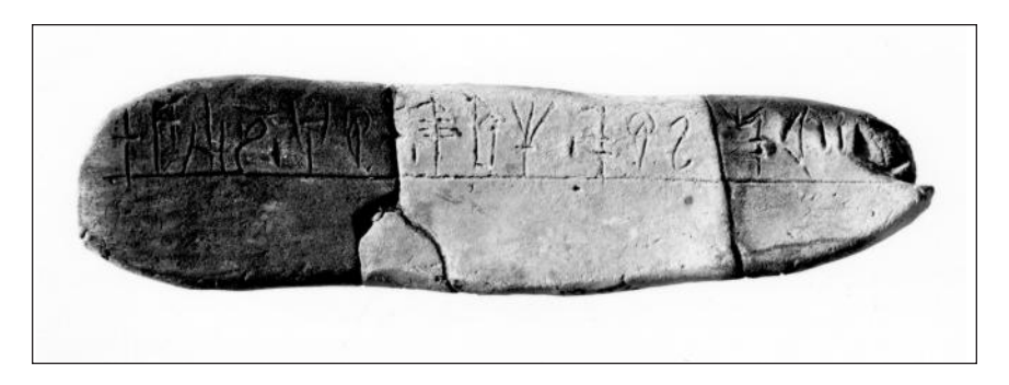
Tablet Fr 1226 recording the offering of sage-scented oil "to the gods."

One spectacular join in recent years has yielded a clear reference to a "fire altar" of the god Dionysos, whose historical myths were once thought to identify a deity whose worship entered Greece well after the Bronze Age, perhaps from Anatolia.