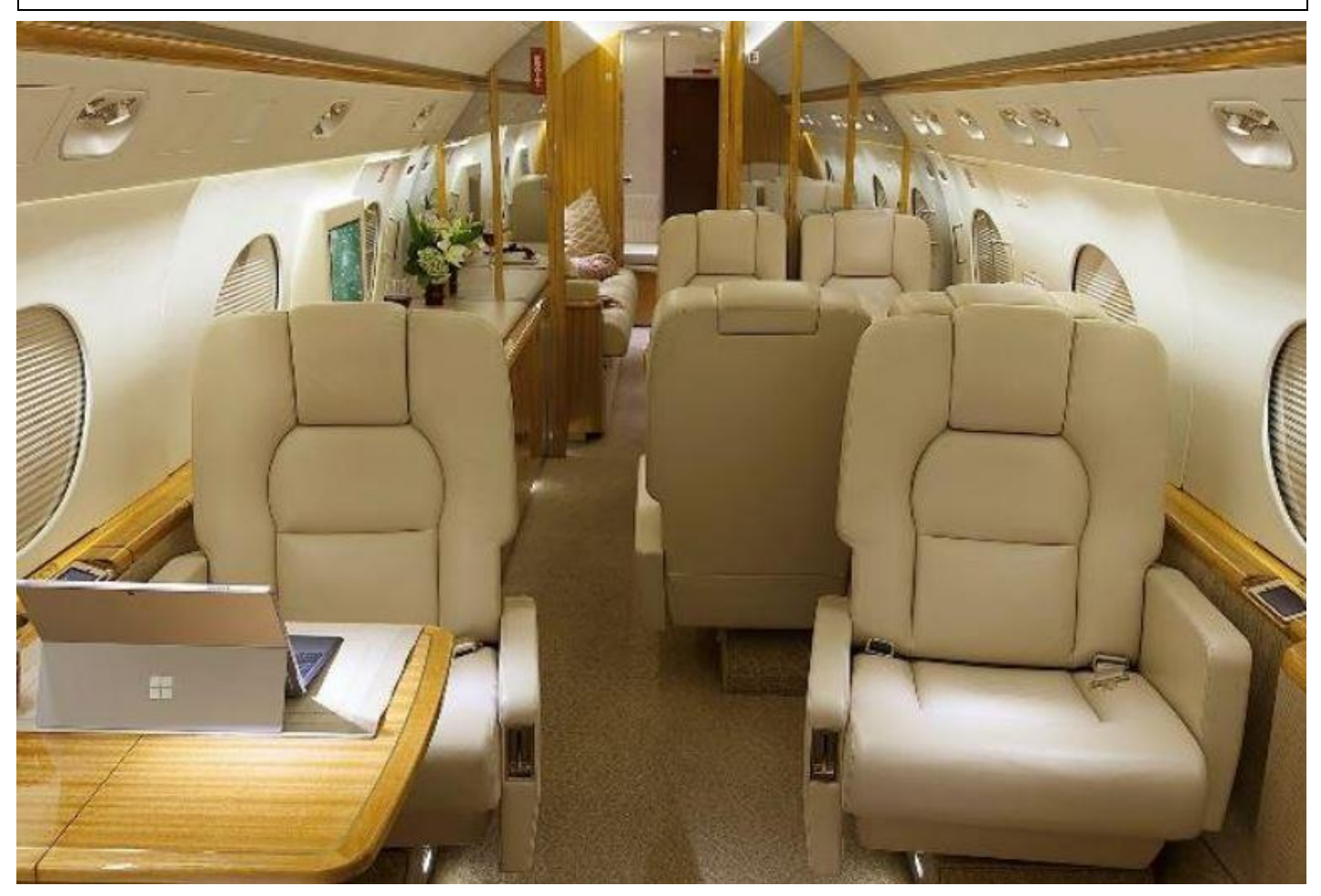
Forrward Cabin Looking Aft

This elegant executive interior seats up to 14 passengers. All passenger seats feature the contemporary G550 style seats. The forward cabin features a four-place club seating arrangement with fold-out side ledge tables. The mid-cabin area features a left-cabin four-person conference group opposite a credenza. Through the mid-cabin bulkhead, equipped with a pocket door, is a spacious aft cabin state room with dual three-person divans. Bulkhead monitors throughout the cabin allow for moviewatching from all seats. A spacious aft lavatory and the forward crew lavatory feature vacuum toilets. A well-equipped forward galley, cockpit jump seat, and in-flight accessible baggage bay complete this interior.