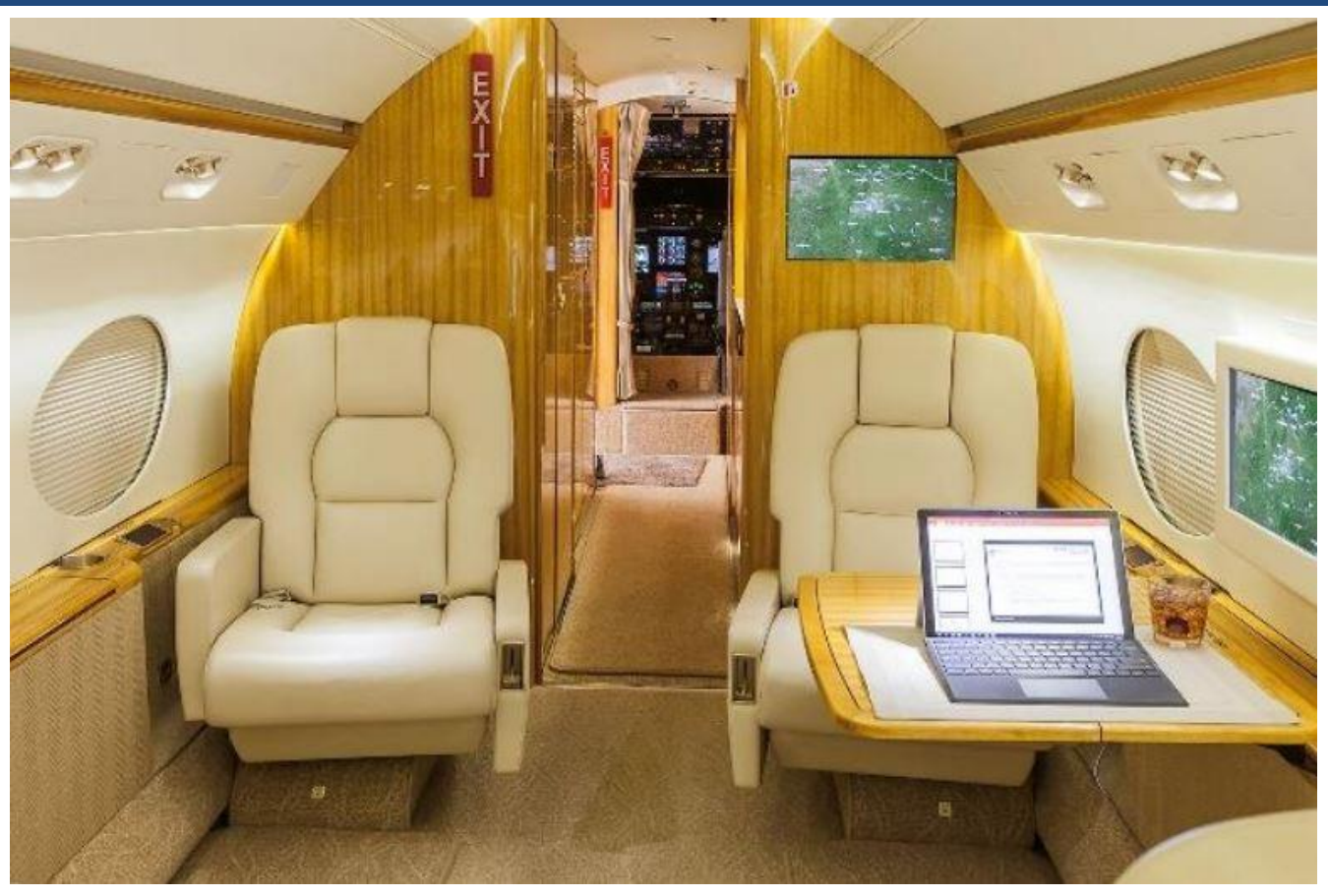
Forward Cabin looking Forward