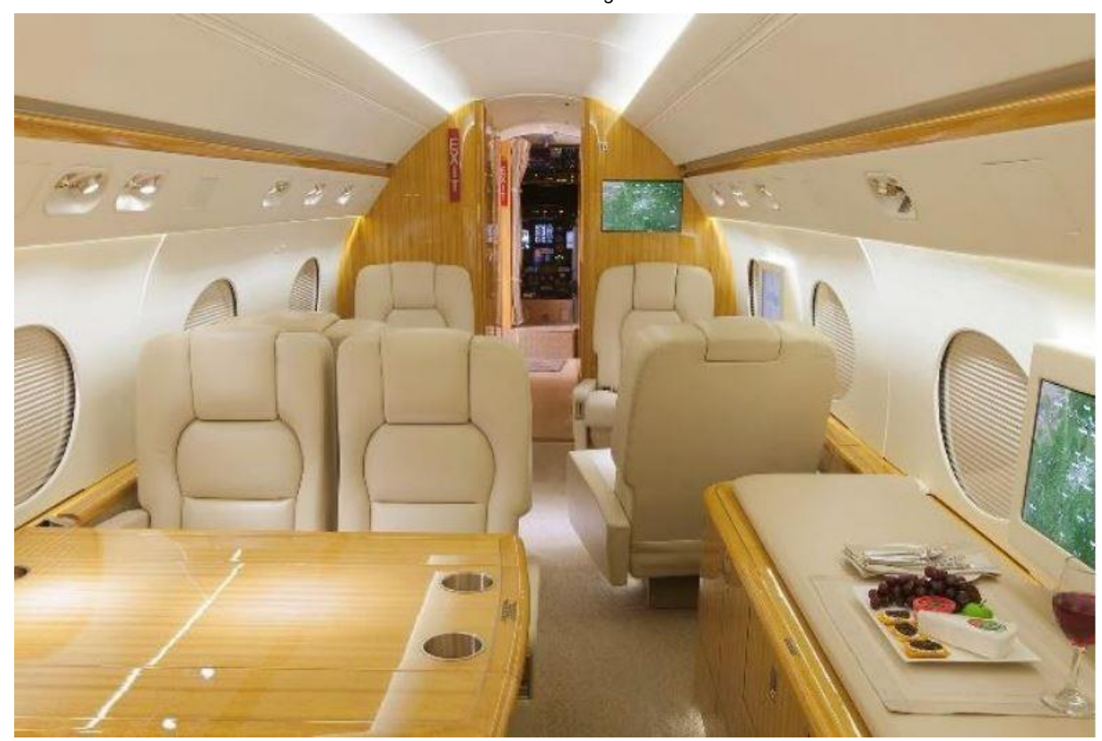
Mid Cabin looking Forward