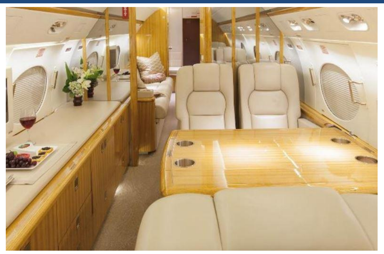
Mid Cabin looking Aft