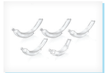
Size 1, 2, 3, 4, and 5 disposable Mac blades are available for the ClearVue™ VL3D.