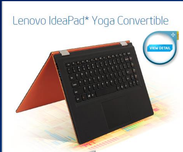
Lenovo IdeaPad* Yoga Convertible